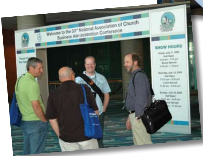
Scenes from the 2009 NACBA National Conference in Long Beach. Scholarships from the Endowment Fund made this amazing experience possible for numerous administrators.

of the retreat touch every current and potential CCA and help all of us to be better trained and up to date in our areas of responsibility.